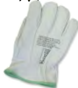
LCG10LV Low Voltage Gloves