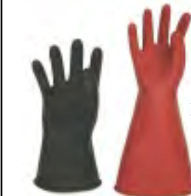
RLG0011 & RLG014 Rubber Insulated Gloves