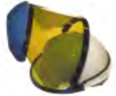
HF75 Helmet Frame Shown with SL712 and CHCP