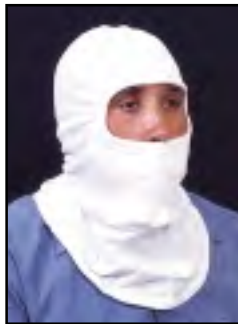
NXL778 Nomex/Lenzing Knit Hood