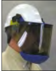
715CCS Face Shield with Chin Cup and Slotted Headgear