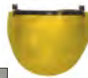
SL712 Shaded Windows