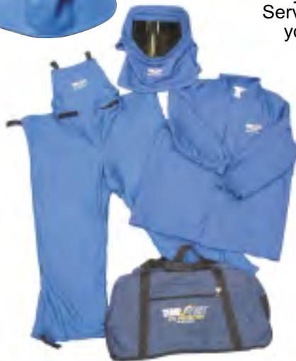
TTK45 Arc Clothing Kit

Call your Stanco Customer Service Representative if you have questions: 1-800-348-1148.