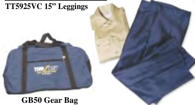
GB50 Gear Bag