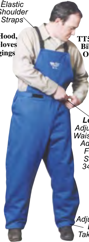
TT59-670 Bib Overalls