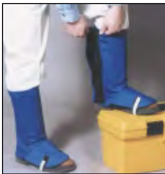
TT5925VC 15" Leggings