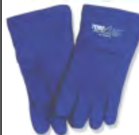
US214WL Gloves Indura Ultra Soft 14" Full Cut Gloves, 10 oz. Wool Lined, Royal Blue Color. ATPV: 76.2