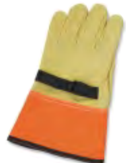
LCG12 Leather Cover Gloves