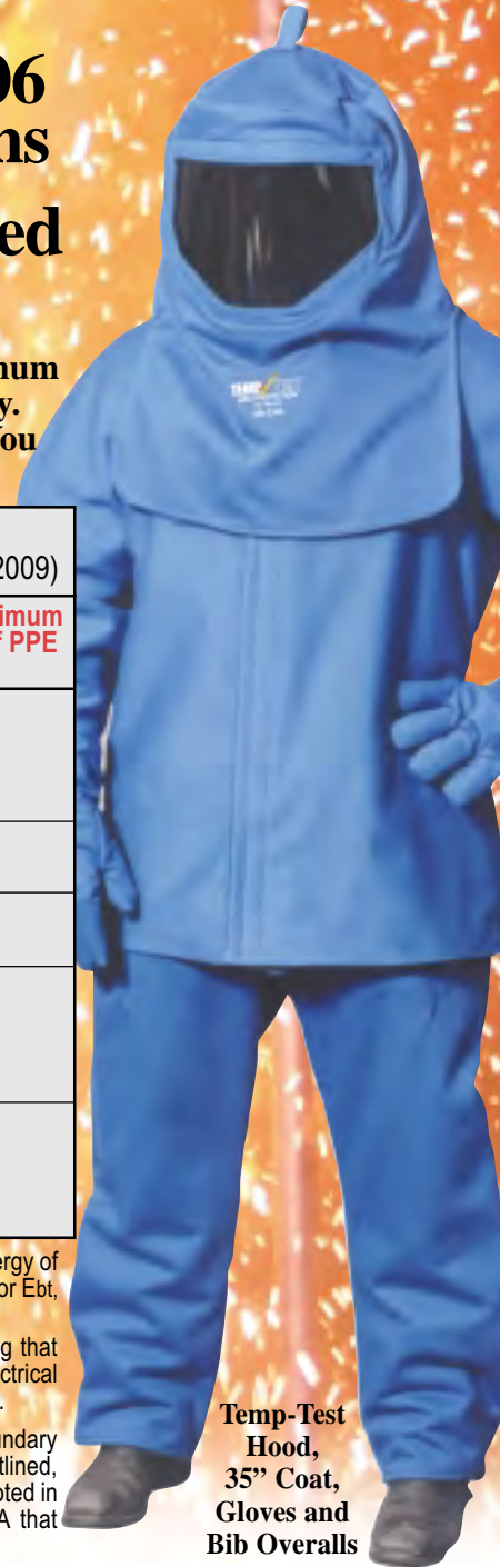
Temp-Test Hood, 35" Coat, Gloves and Bib Overalls

Employers must assess the potential hazard and determine the flash protection boundary distance. Stanco's Protective Clothing has been designed to meet standards, as outlined, for a particular Hazard-Risk Category with a minimum ATPV Rating of the value, noted in the Protective Clothing Characteristics section. It has been confirmed by OSHA that garments which meet the requirements of ASTM F1506 are in compliance with OSHA 29 CFR 1910.269 .