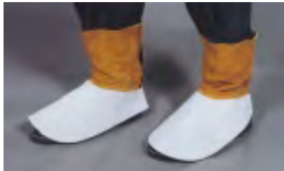
GB32 - 6" Leather Spat