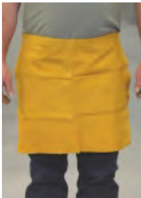
GB224W - Waist Apron