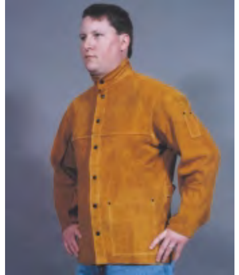
GB2630 - 30" Jacket