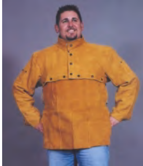
GB2601 - Cape Sleeve shown with GB220 - 20" Bib