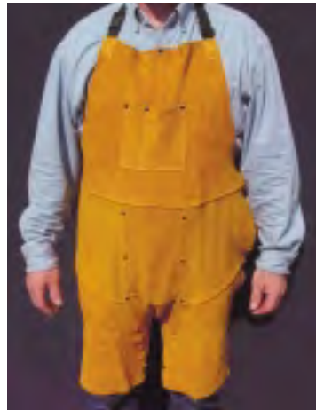
GB242SL - Split Leg Apron