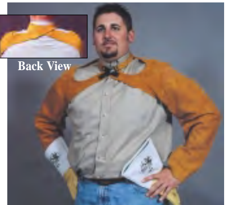
GB223SLV - 23" Sleeves