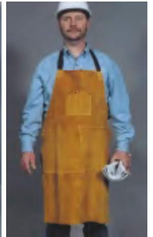
GB236B - 36" Bib Apron