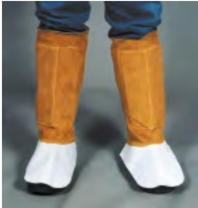
GB24 - 14" Leather Legging