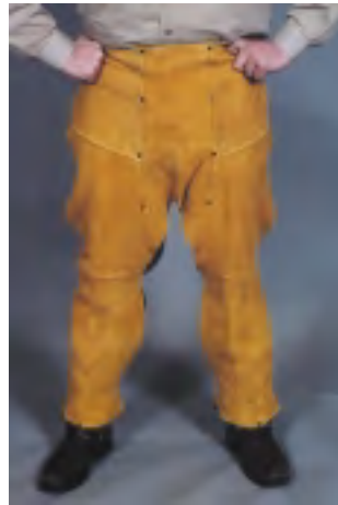
GB2505 - 25" X 40" Waist Chaps