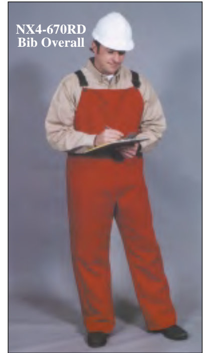
NX4-670RD Bib Overall