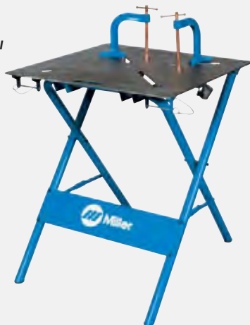
Shown with optional 5-inch X-clamps.

Wheels, handle, and fold-up design make unit easy to take to the jobsite or move around the shop.