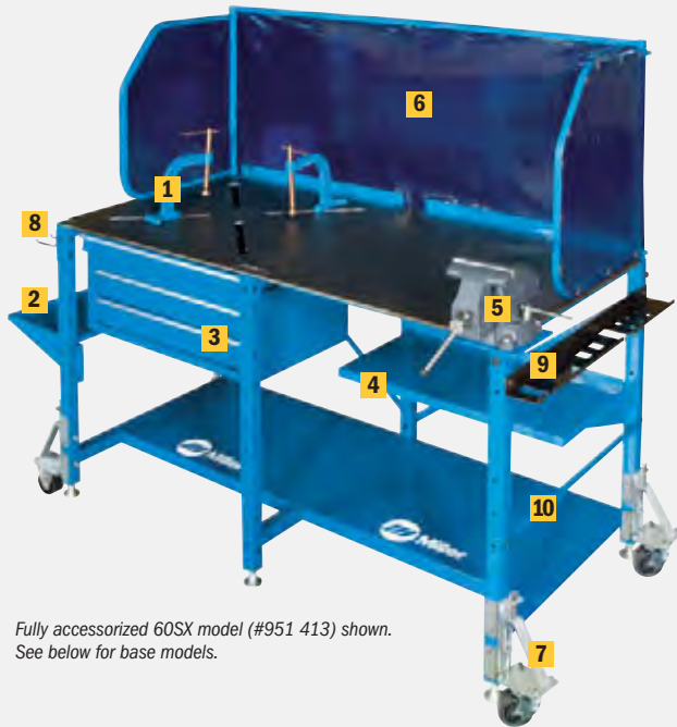
Fully accessorized 60SX model (#951 413) shown. See below for base models.

The S-Series is perfect for the welder who needs a tough workbench for the fab shop or the home garage.